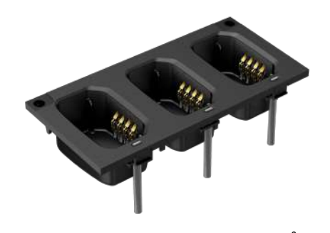
ION BATTERY ADAPTOR FOR EXISTING<sup>9</sup> MOTOTRBO MULTI-UNIT CHARGER