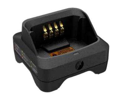
IMPRES 2 SINGLE-UNIT CHARGER