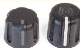
Standard Control Knob RFID Control Knob

◀ Optional colour identification bands for groups with different tasks, coverage areas or shifts