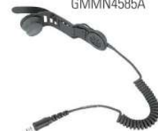
Savox HC-1 GMMN4585A

Complete the solution with the Savox C-C400 com-control unit that enables the use of your two-way radio in hazardous conditions. Designed to be especially robust for the most extreme environments, the extra-large push-to-talk button ensures transmission even when used underneath gear and protective clothing.