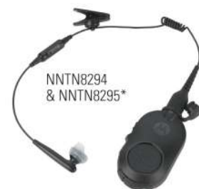
NNTN8294 & NNTN8295*

Bluetooth 2.1 audio is embedded in the radio enabling fast and secure pairing with a variety of Bluetooth accessories. Easy to attach and pair, Motorola Solutions Bluetooth accessories enhance performance and security wherever you work. Officers can talk discreetly undercover, move without wires and use their radio like never before.