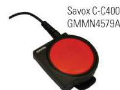
Savox C-C400 GMMN4579A

Complete the solution with the Savox C-C400 com-control unit that enables the use of your two-way radio in hazardous conditions. Designed to be especially robust for the most extreme environments, the extra-large push-to-talk button ensures transmission even when used underneath gear and protective clothing.