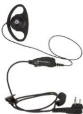
D-Style Earpiece with In-line Microphone and PTT