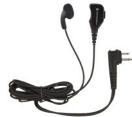
Earbud with In-line Microphone and PTT

XT600d Series radios are compatible with XT400 Series accessories except the carry holster and leather case.