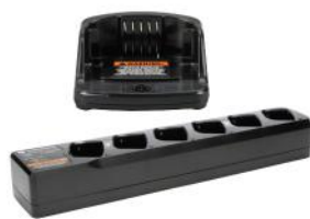
Single and Multi-Unit Chargers