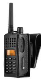
Leather Carry Case