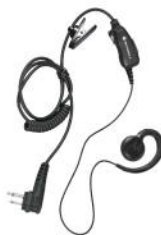
Swivel Earpiece with In-line Microphone and PTT