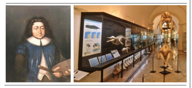
THE SEA MUSEUM OF GALLIPOLI

In Cleaning cuttlefish, remove bone and skin. Put to marinate with olive oil, salt, pepper and then roast on a moderate heat, soaking occasionally with the marinade during cooking. Serve with a few tufts of parsley and, if desired, sprinkle with lemon.