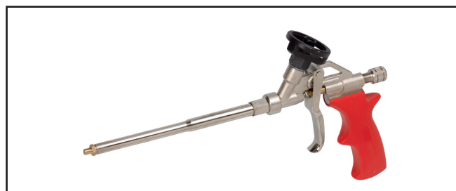
Foamplus gun PU PLUS professional model code 3785