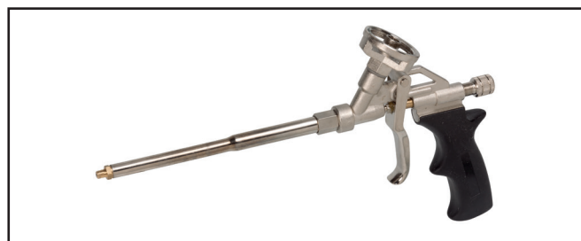
Foamplus gun PU code 3784