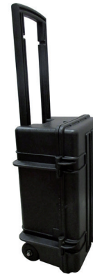
Carry case with wheels