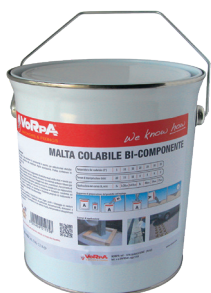
MULTiset PLUS content 5 kg.