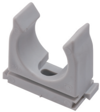
KPO plastic clip