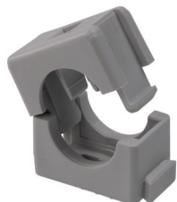
KP nylon clip