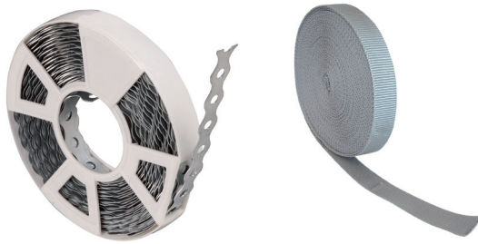
Zincplated/A2 SS banding *