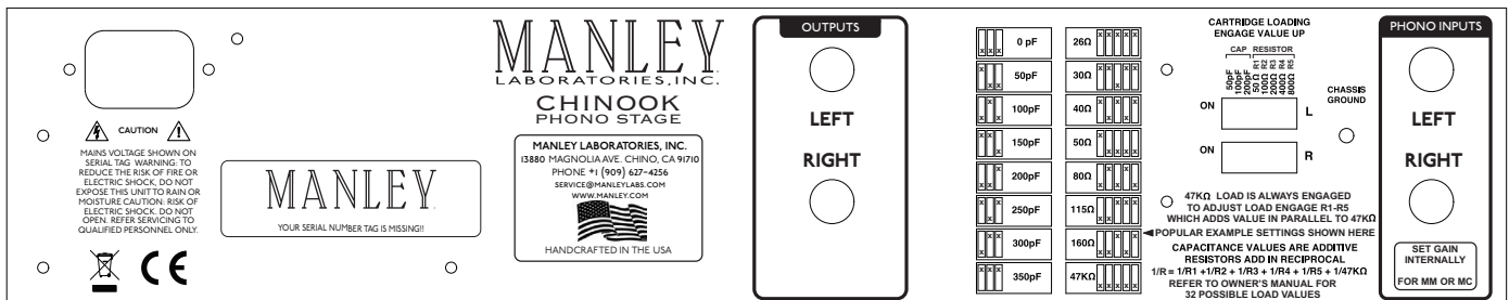
Fig.1 - Rear Panel Layout

See Below Fig.1; An example of the rear panel showing the location of the loading dip switches.